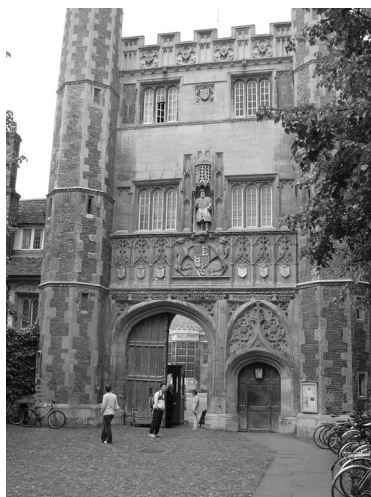
(Photograph) The main entrance of Trinity College. Newton and Ramanujan both studied here.